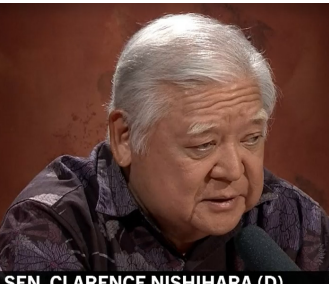
SEN. CLARENCE NISHIHARA (D)

In the event of future pandemics, portions of the new OCCC can also be repurposed to house non-chronic inmates who may be infected.