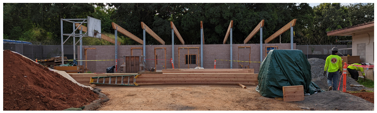
Construction Progress Photos, March 2022