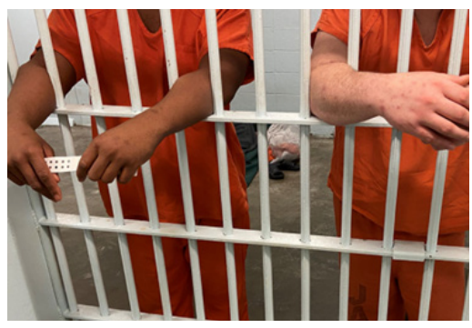
Detainees held at OCCC