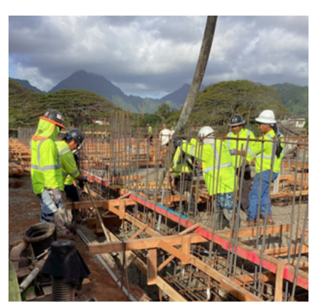
Construction Progress Photos, March 2022