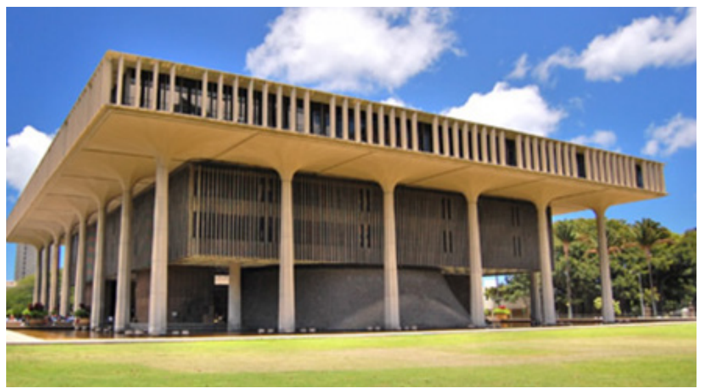
Legislative sessions held at State Capital Building

Other bills currently under consideration are described on the following page. Each is intended to divert defendants from detention, assist inmates to acquire civil identification cards, support new and existing community-based furlough programs, among other proposals. Future public policy initiatives may also address certain low-level non-violent felonies and technical probation violations as well as additional measures to divert individuals from detention.