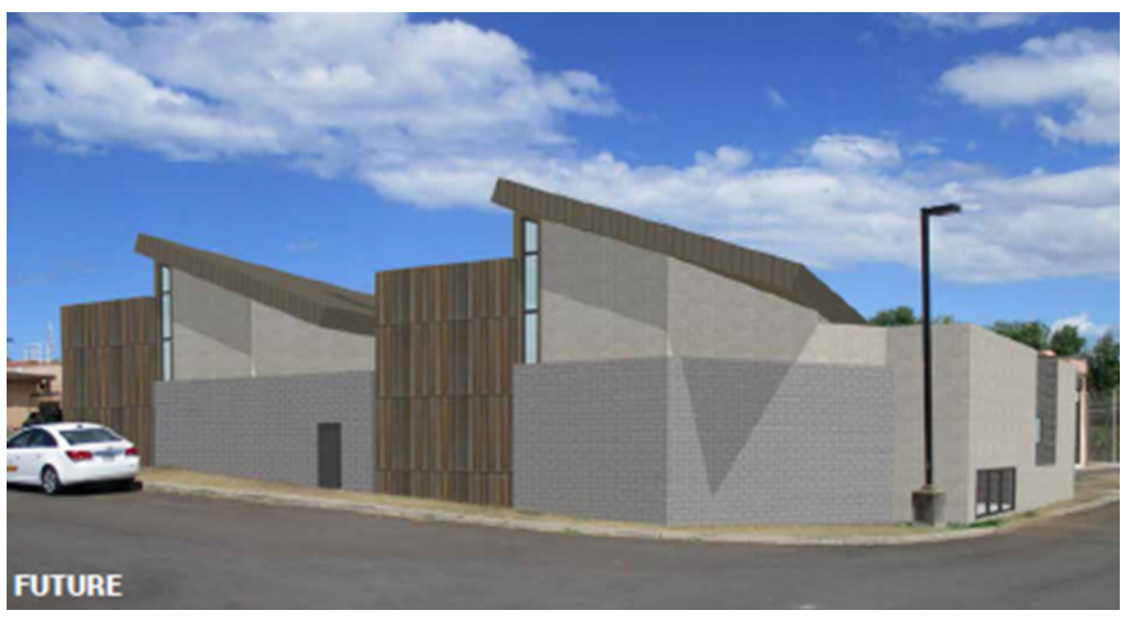
Site of planned housing unit at MCCC. Credit: DLR Group.