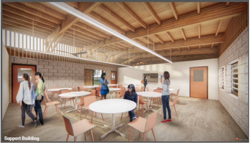
Rendering of completed multi-purpose building.

In addition to the new construction currently underway at WCCC, PSD is also renovating the formerly vacant Ho o'kipa Cottage to convert it into a useful addition to the campus. Renovation of the cottage structure and the addition of a multi-purpose support building will provide a new living environment for female offenders that will emphasize rehabilitation and normalization while providing life skills for a successful transition out of custody. The photos below capture the considerable progress in constructing the multi-purpose building which, when completed in late 2022, will provide