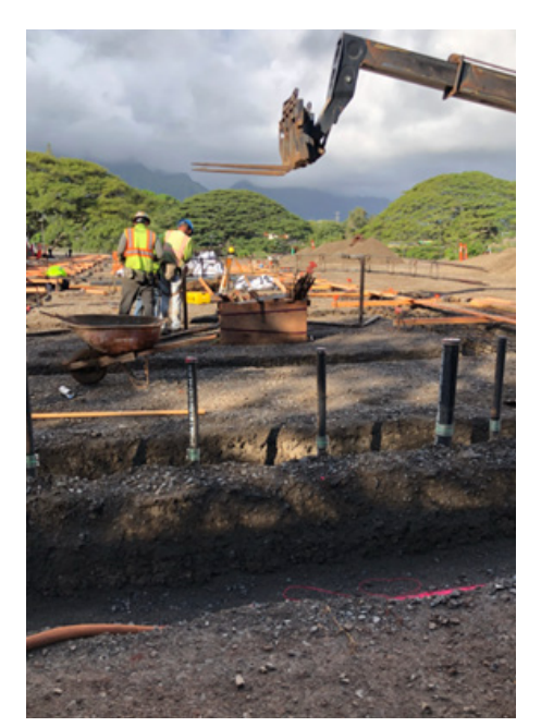
WCCC construction photos (February 2022).