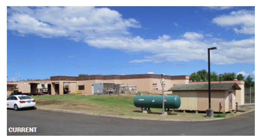
Site of planned housing unit at MCCC.

Following submission of the assessment report and monitoring plan, the State Historic Preservation Division (SHPD) acknowledged that the reports met the requirements of HAR §13-276-5 and HAR §13-279-4 (February 2, 2022) and have been accepted. SHPD also concurred with archaeological monitoring for identification purposes during all ground disturbing work associated with the project and with that, construction of the new housing unit and chiller plant at MCCC will begin shortly.