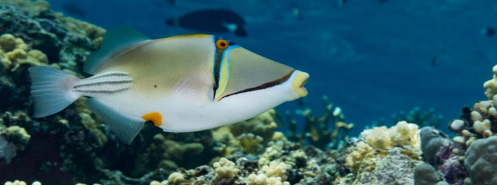
Hawaii's State Fish: Humuhumunukunuku apua`a (Hawaiian Trigger Fish)