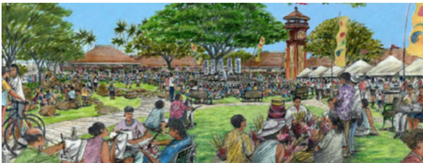
Redevelopment of OCCC property as envisioned within 21st Century Kalihi Vision Report