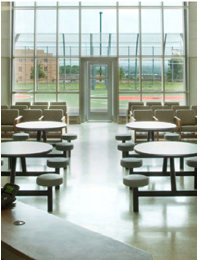
Modern dayroom with natural light