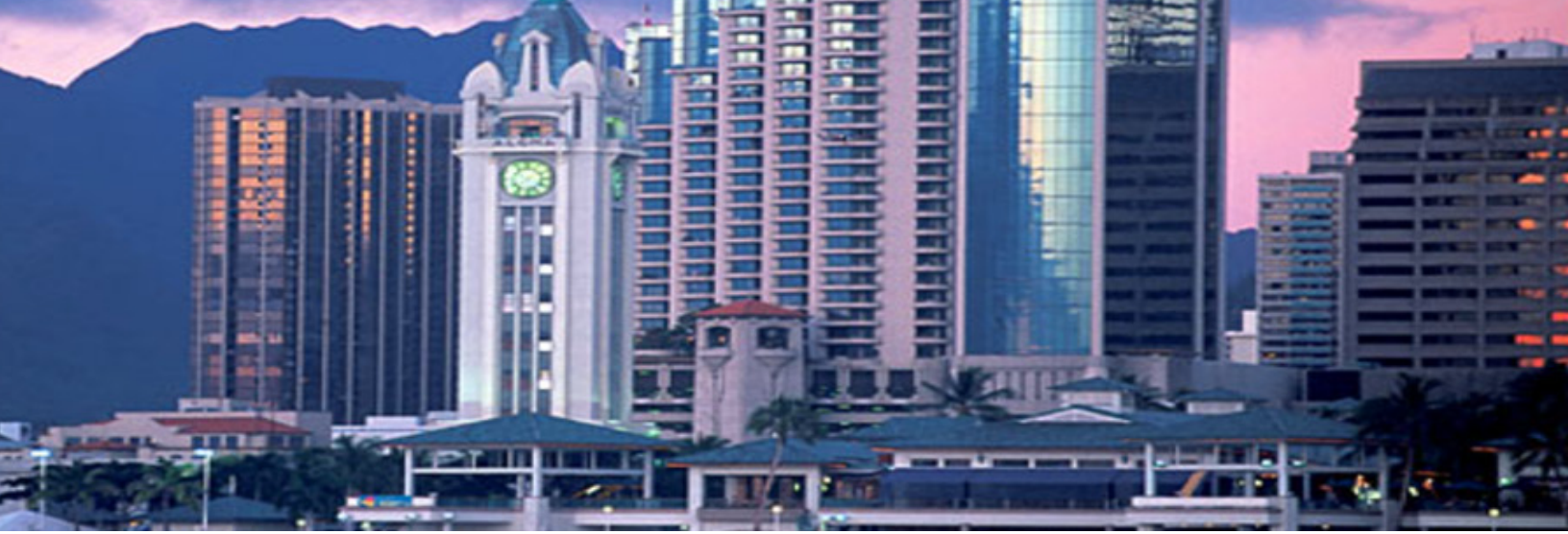
Aloha Tower and Downtown Honolulu at sunset.