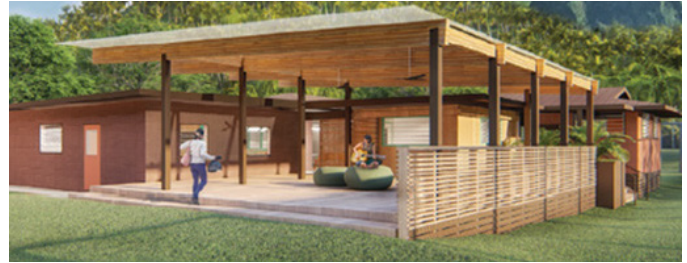
Conceptual rendering of Ho'okipa Makai Cottage (after renovations)