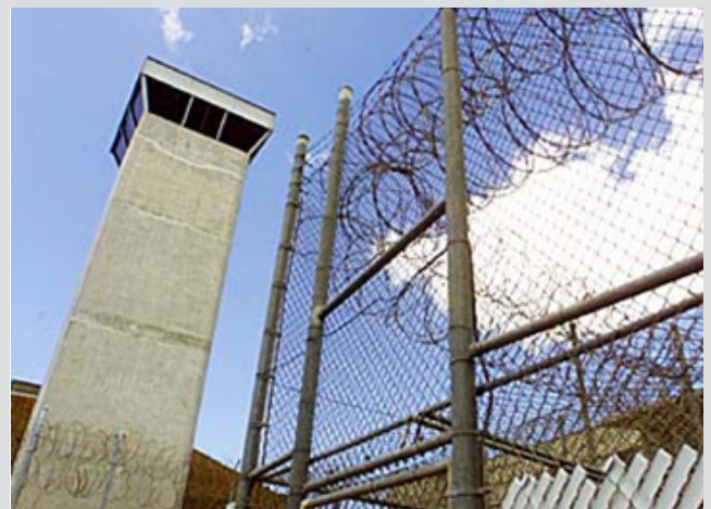
Current OCCC -- Kalihi, Hawaii

Since the 1990s, the State of Hawaii has conducted numerous studies of its correctional system infrastructure including Master Plans for upgrading and improving the jails and prisons operated by PSD. OCCC has been the subject of various studies with each study documenting its obsolete design; declining physical plant; and inefficient, ineffective, and costly operation. Findings common among each of the studies are the need to replace the current OCCC with a new jail designed, constructed, and operated to modern standards and approaches, which today emphasize reducing the high incarceration rate, ensuring racial equity, and providing facilities that are therapeutic rather than punitive. With considerable documentation in hand, planning for a new OCCC began in earnest in 2016 with PSD recognizing the opportunity to significantly change the current system and improve how individuals are housed and treated while held at OCCC.