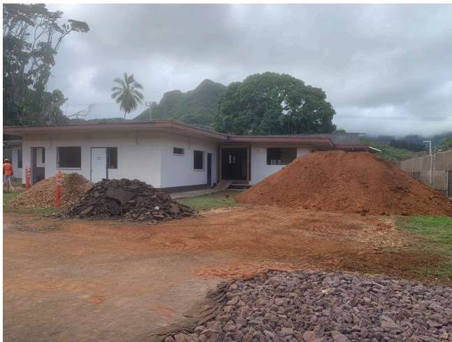
Site work progressing along exterior of cottage building