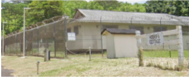
Ho'okipa Makai Cottage (before renovations)

In addition to the construction currently underway, renovation of the vacant Ho'okipa Cottage at WCCC is also underway. Located southeast of the main WCCC campus, the Ho'okipa Cottage comprises a former Superintendent's residence and adjoining garage that were last used by PSD as a training facility. PSD is moving forward with renovations to the cottage that when completed, will house up to 66 female furlough and work line inmates. The renovated Ho'okipa Cottage will also accommodate training programs, including resume and interview preparation, as well as courses that help occupants to work toward secondary and tertiary degrees. With renovations scheduled for completion in 2022, look for renovation updates and photographs in future newsletters.