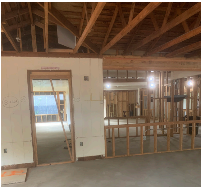
Interior construction progressing to create upper dayroom