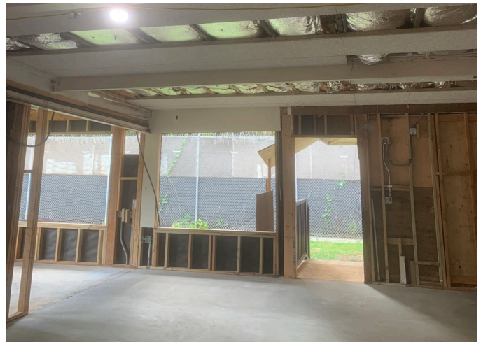
Interior construction to create large dorm room underway