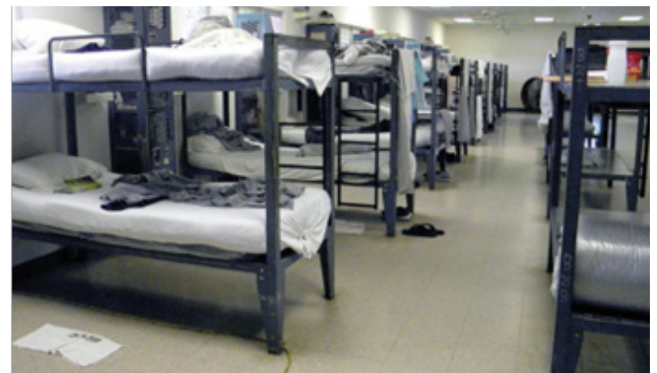
Modern vs. traditional transition housing Credit: CGL Companies