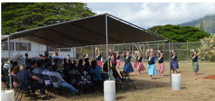
WCCC inmates perform hula at the groundbreaking.