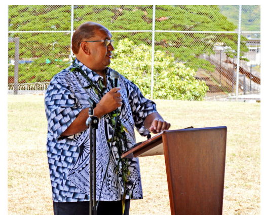
The event received a traditional blessing.