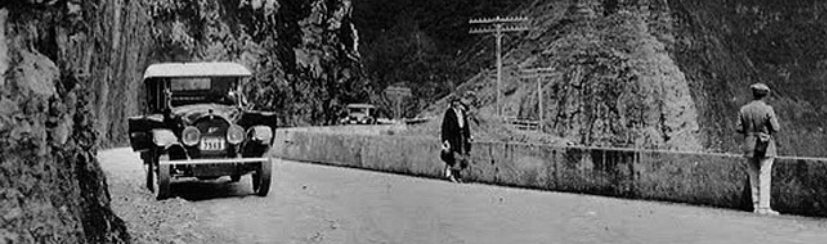
Old Pali Road from Honolulu over the Koolau mountain range to Kailua, c. 1900.