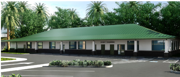
New Administration Building (Credit: CGL Companies)