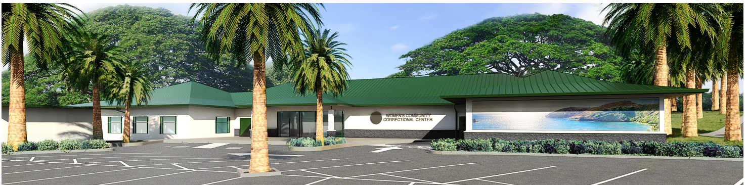
New Visitation/Intake Building