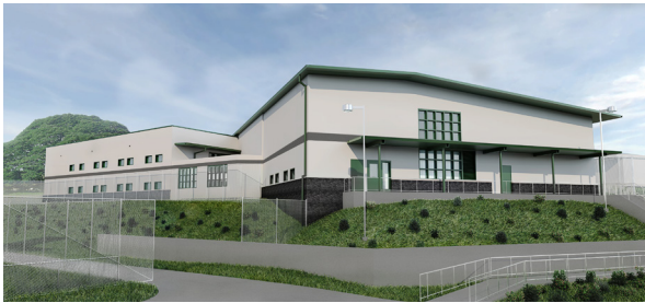
New Housing Unit A