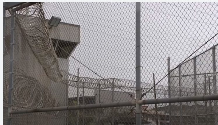
Oahu Community Correctional Center, Kalihi