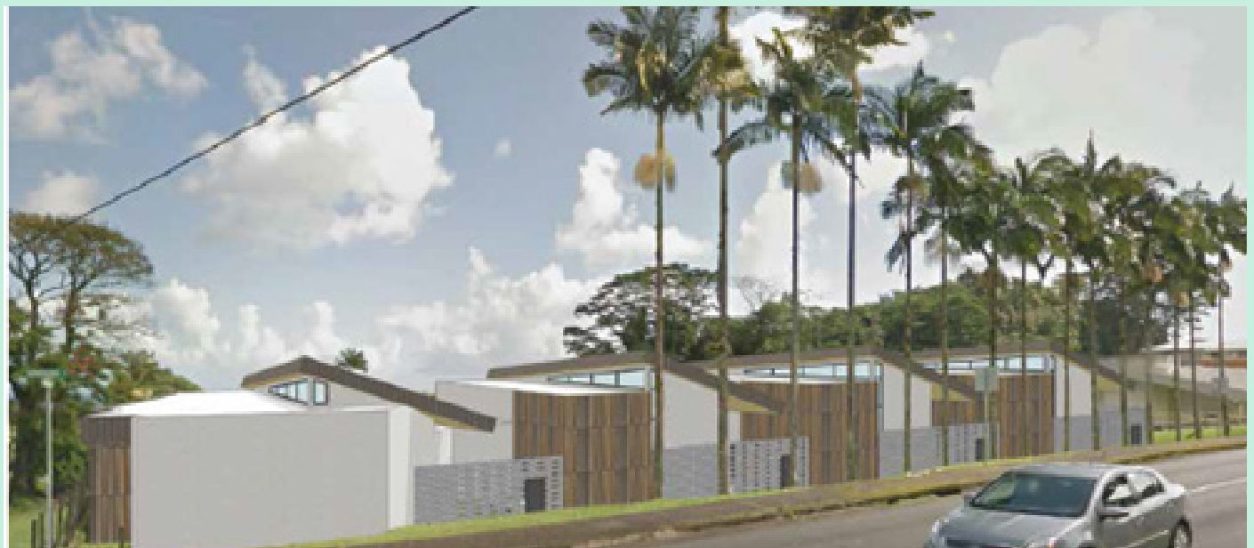
Rendering of new HCCC housing unit