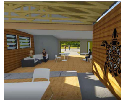
Dayroom facing North