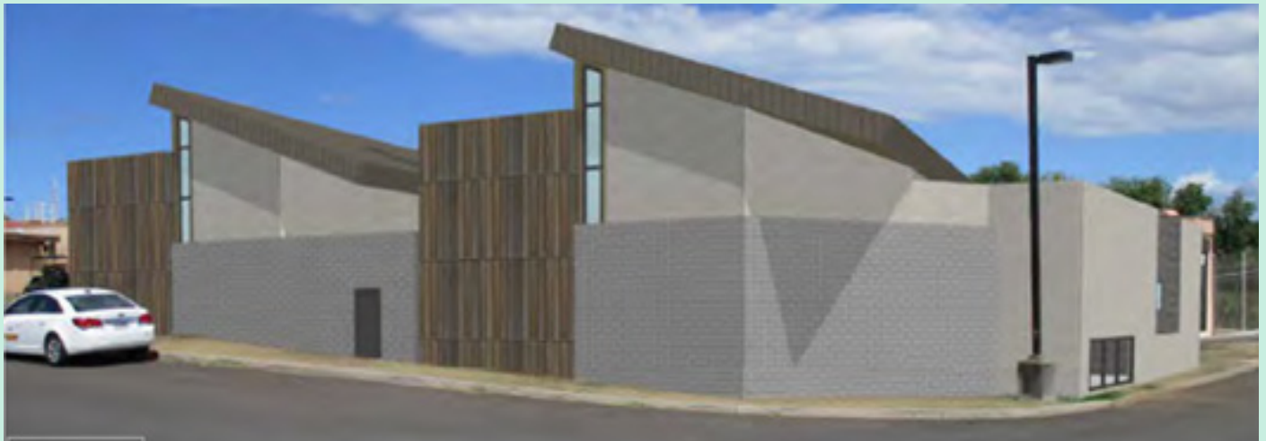
Rendering of new MCCC housing unit

Once constructed, the new housing units will be a substantial improvement over current conditions. The new housing units will provide occupants with natural daylight, views to the outdoors, improved acoustics, thermal comfort, and adequate space, all of which have been shown to reduce the levels of stress, depression, and fear of being victimized among inmates. Enhancing the feeling of safety and lowering stress levels for occupants and staff is expected to also have a positive effect on overall institution safety and security.