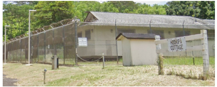
Current Ho'okipa Makai Cottage at WCCC

The Women's Community Correctional Center (WCCC), located on Kalaniana'ole Highway in Kailua on the site of the former Hawaii Youth Correctional Facility, is the only all-female correctional facility in Hawaii serving the needs of female offenders. Located southeast from the WCCC's housing units and Administration Building, is a former Superintendent's Cottage and an adjoining garage.