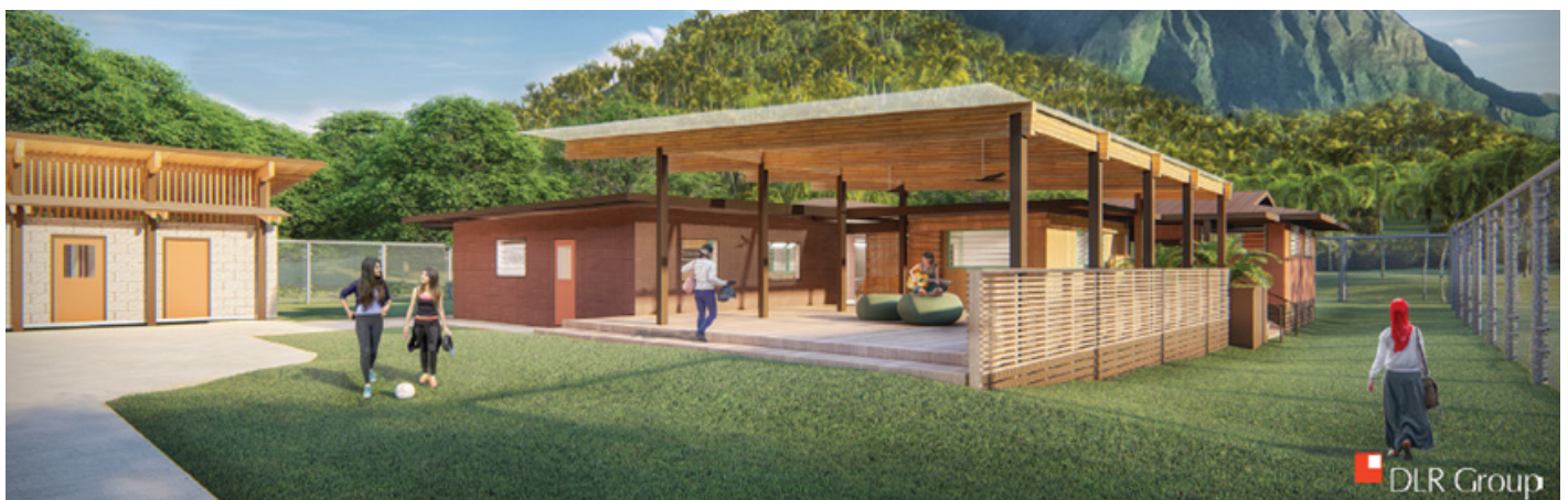
Conceptual renderings of renovated Ho'okipa Makai Cottage