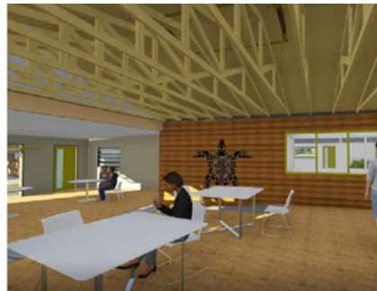
Dayroom facing East