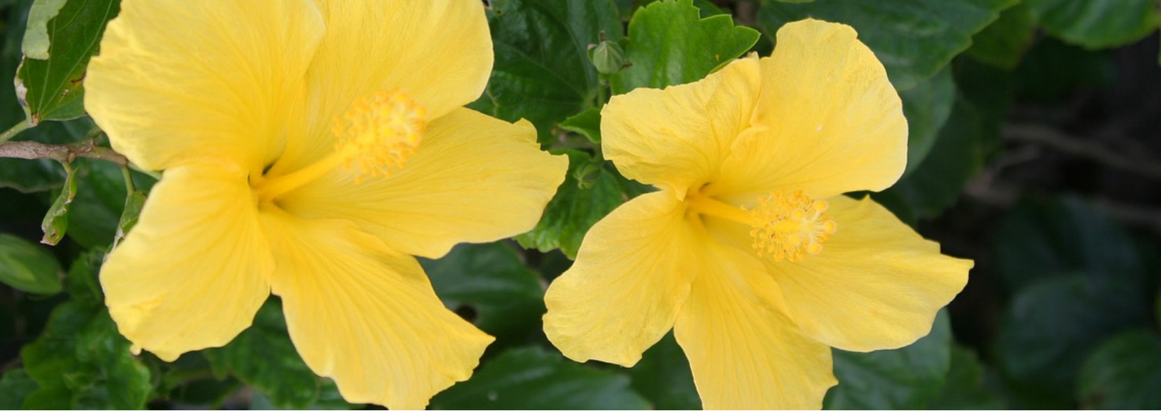
Hawaii's State Flower: Yellow Hibiscus