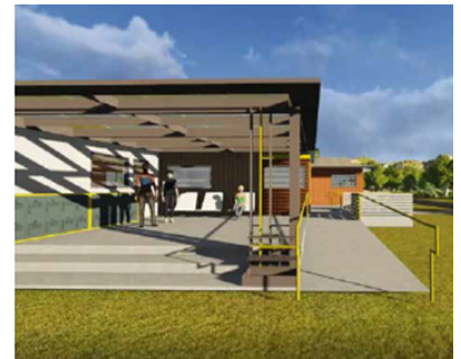
Front entry to Main Cottage