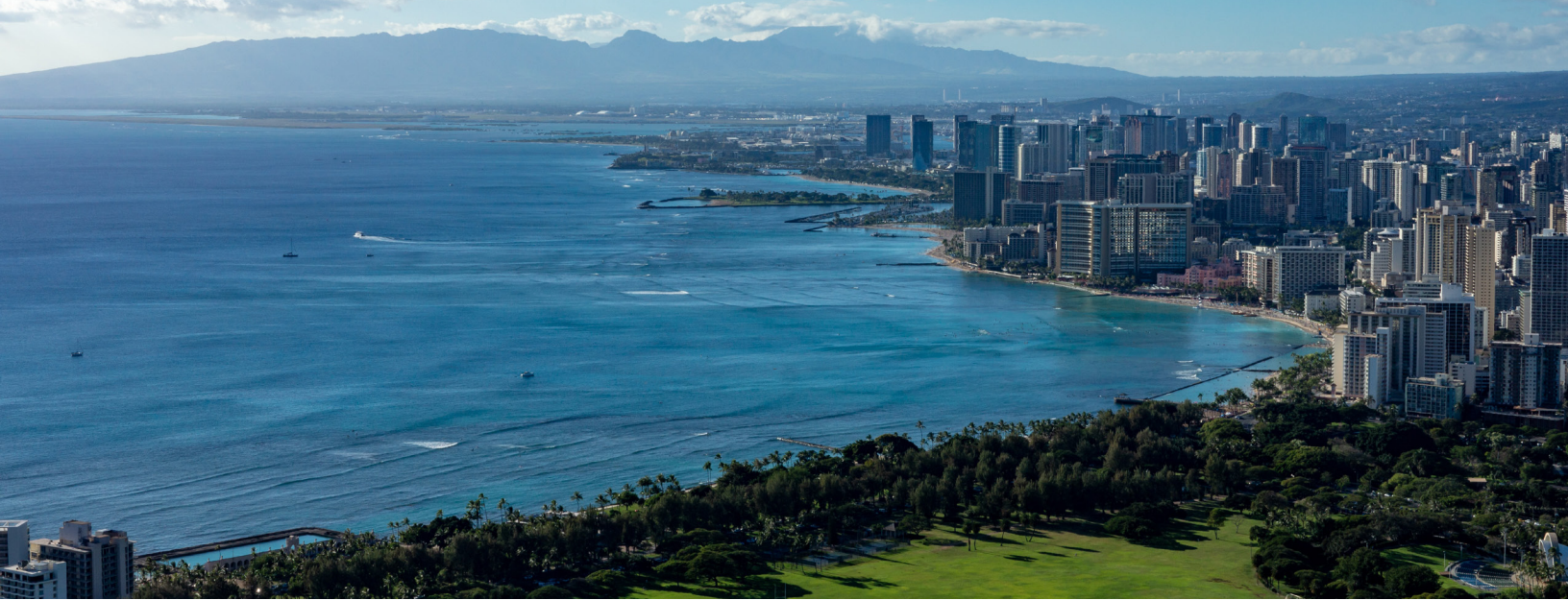
View of Honolulu.