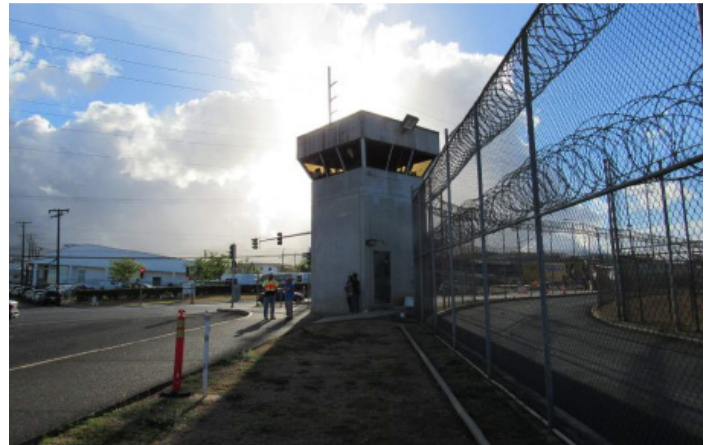
Guard tower at existing Oahu Community Correctional Center

OCCC, operated by PSD, is currently the largest jail facility in the State of Hawaii and acts as the local detention center for the First Circuit Court. Originally developed in Kalihi in 1916 as the Oahu Prison, the facility was redeveloped in 1975 as part of a county-based community correctional system concept with 456 beds. OCCC was subsequently expanded and currently has a design capacity of 628 beds and an operational capacity of 954 beds. Recent studies conducted of OCCC have documented its declining physical plant, its inefficient operation, and the lack of space for inmate programs and treatment services. In fact, one of the original 1916 structures is still in use at OCCC today.