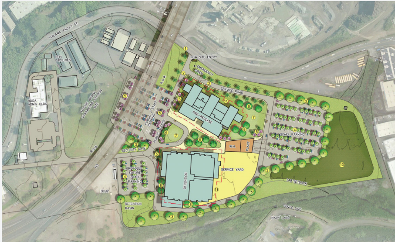
Proposed OCCC at AQS (conceptual)