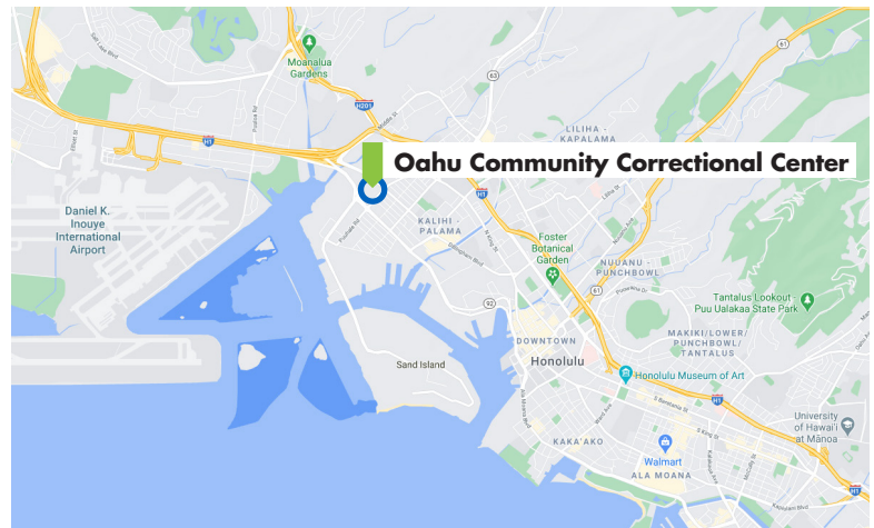
Location of existing OCCC in Kalihi

The information, input, and advice received from Respondents to the RFI will inform and/or refine assumptions and expectations regarding the planning, procurement, and eventual delivery of the new OCCC.