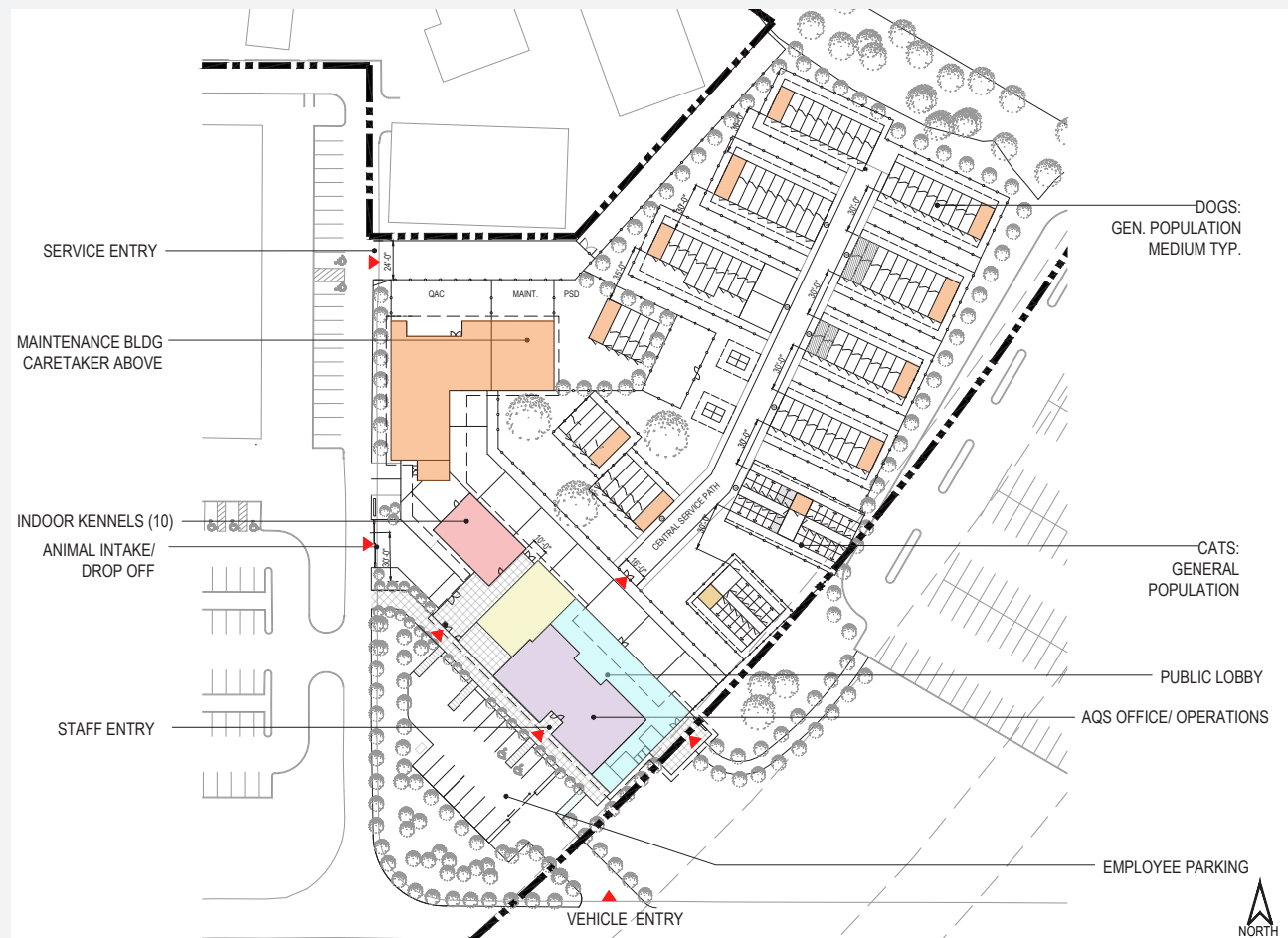
Proposed AQS (Conceptual)