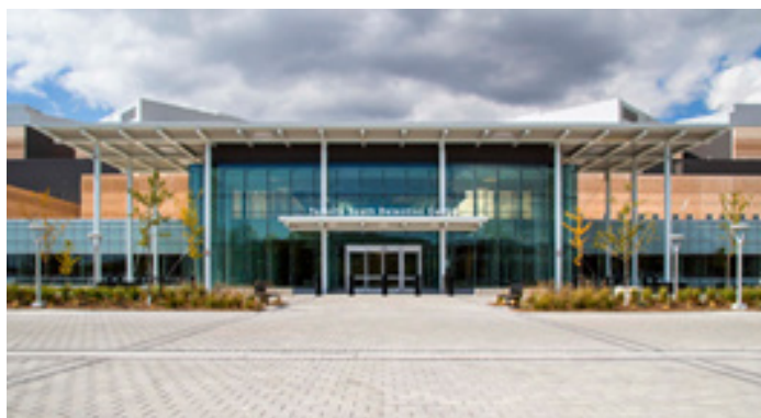
Toronto South Detention Centre, Canada.