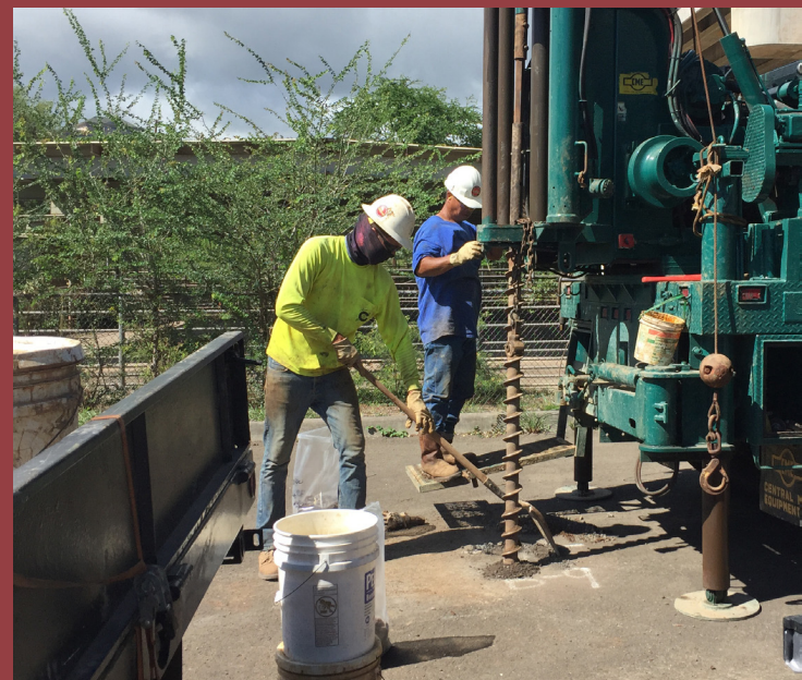
Soil borings at Animal Quarantine Station (Geolabs, August 2020).

A comprehensive and thorough understanding of subsurface conditions within the AQS property is an essential part of the planning process and plays an important role in the determining optimum locations for OCCC structures, whether conditions exist that will require special engineering designs, and in estimating the cost of site preparation and foundation construction. To address those topics, a preliminary geotechnical program of the AQS property (east of H-3) is underway involving soil borings, soil sampling and laboratory testing, subsurface analysis, and groundwater measurements. Common to such investigations is the need to determine on-site features and