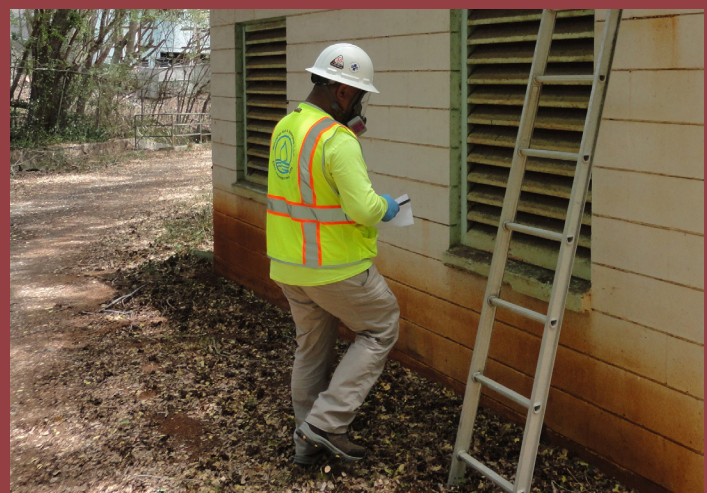
Material samplings at Animal Quarantine Station.