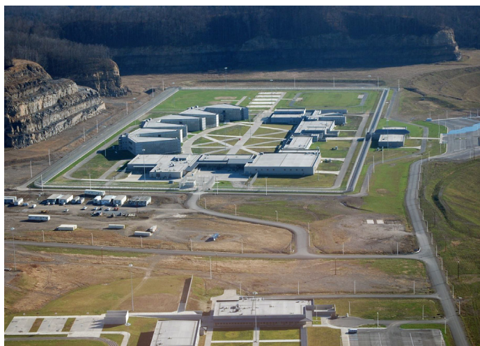
Federal Correctional Institution in Welch, West Virginia (i.e., prison). Large, low-rise, sprawling institution for long term offenders.