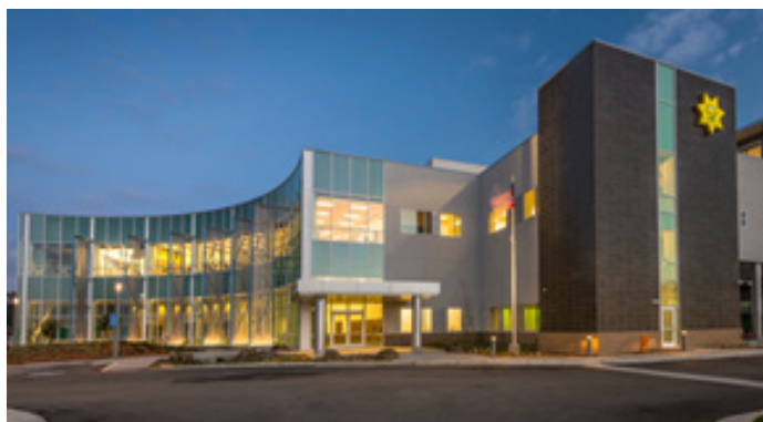
San Mateo County Jail, Redwood, California.

The differences between a jail and a prison may not be obvious to the casual observer. While jails and prisons must both meet inmates’ basic needs, both are required to provide access to many of the same programs and services. Because the length of time jail inmates are incarcerated is often measured in days and not years, the focus of jail programs and services is on stabilization versus a prison’s focus on long-term rehabilitation. In addition, a jail operates on a ‘decentralized’ services model whereby programs and services are delivered to jail inmates in their housing areas.