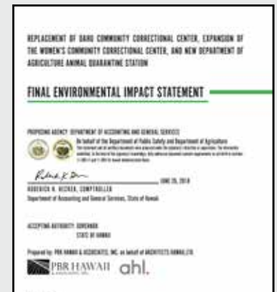
Cover of the FEIS

Diverse groups of elected officials, government agencies, stakeholders, and the public-at-large shared comments and questions during the 60-day public comment period for the Draft EIS. More than 250 individuals, 12 organizations, 15 federal, state and city/county agencies, and 7 elected officials submitted written comments and questions to PSD and the Hawaii Department of Accounting and General Services (DAGS) concerning the proposed OCCC project and the Draft EIS in addition to comments received during the Town Hall meeting held on November 29, 2017. Since the end of the comment period (January 8, 2018), PSD, DAGS and the Consultant Team have completed responses to the comments and questions for inclusion within the Final EIS along with necessary updates or revisions to technical information contained within the Draft EIS.