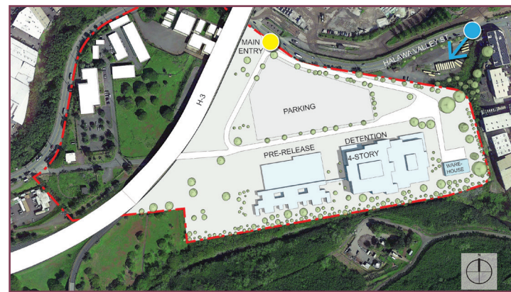
Animal Quarantine Facility Site showing OCCC conceptual development plan