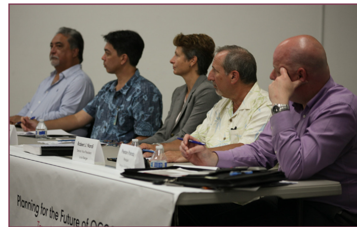
OCCC project leadership team