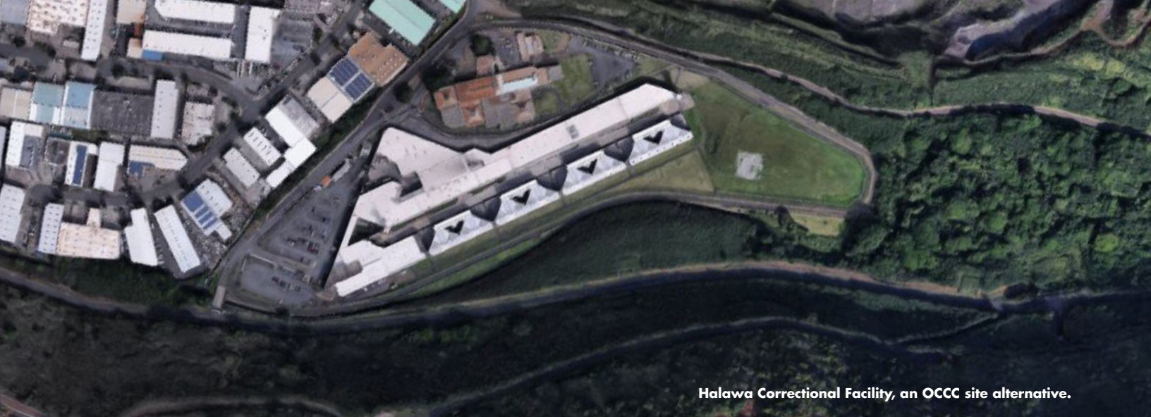
Halawa Correctional Facility, an OCCC site alternative.