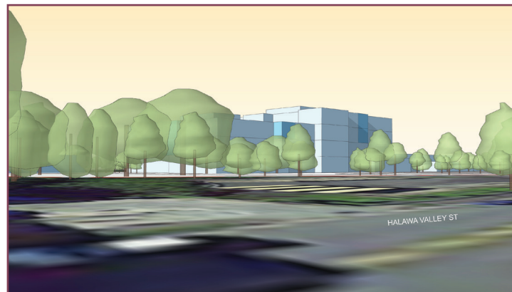
Animal Quarantine Facility Site massing diagram

Mr. Potratz summarized the efforts to be accomplished over the next 12 to 18 months as follows: