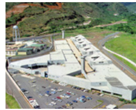
Halawa Correctional Facility

With the onset of the planning process, PSD and its consultants have begun gathering information about prospective locations under consideration as potential OCCC replacement sites. This includes redevelopment at the current OCCC location as well as on property comprising the Halawa Correctional Facility. These and other sites will undergo initial evaluations to determine suitability relying upon previously gathered information, published data sources, as well as field investigations. PSD is also soliciting interest and potential sites that could accommodate the OCCC development. Sites that most closely address PSD's requirements will be subjected to in-depth study that will eliminate less suitable sites until only the most suitable sites remain for further in-depth study.